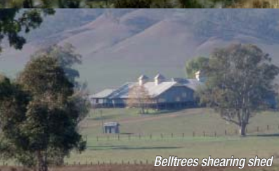
Belltrees shearing shed