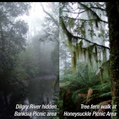
Dilgry River hidden at Banksia Picnic area