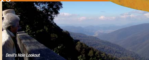
Devil's Hole Lookout