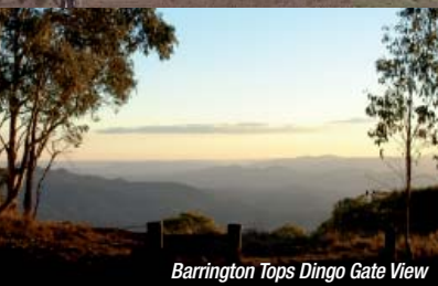
Barrington Tops Dingo Gate View