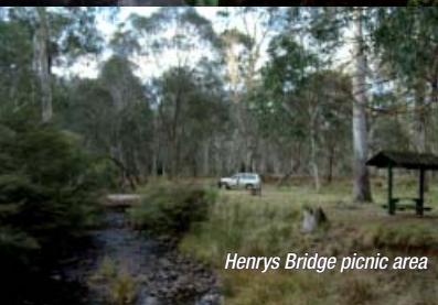
Henry's Bridge picnic area